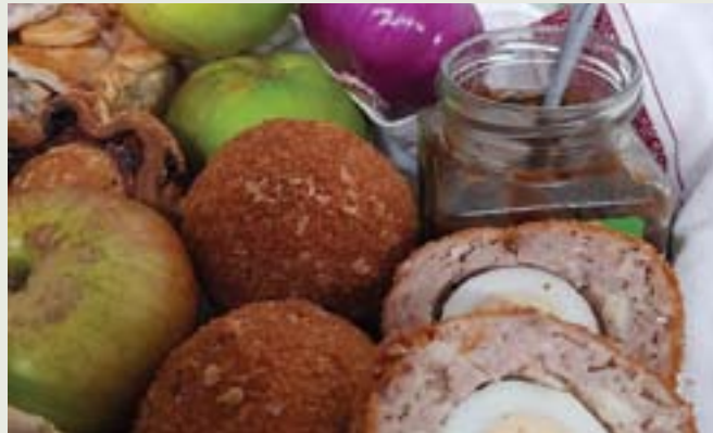
Frocester Fayre Farm Shop

All products and prices are ex farm and are subject to availability and market fluctuations.