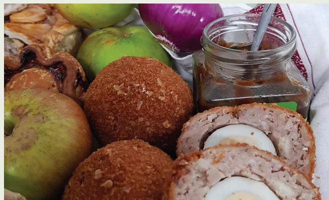
Frocester Fayre Farm Shop

All products and prices are ex farm and are subject to availability and market fluctuations.